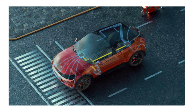
Figure 1. Communication protocol technology highlighted within a vehicle.

In this paper, four automotive communication protocols are examined: the Ethernet, FPD-Link<sup>™</sup> technology (a proprietary automotive serializer/deserializer (SerDes) protocol), CAN bus and the PCIe bus, highlighting core nuances of each technology and offering examples and the features where these technologies support modern automotive driver assistance systems (ADAS) architectures as illustrated in Figure 1 .