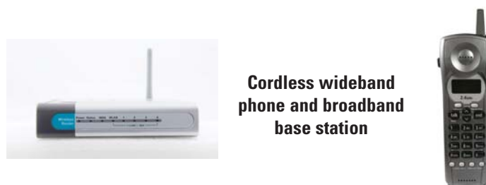
Figure 3: Wideband cordless phone and base station with integrated broadband access and VoIP gateway features

Standards such as the W-DECT specification already have been developed for wideband cordless connections between an RG and handsets. In the future, a wideband cordless phone and base station with integral broadband access and VoIP gateway features will be a common platform for the deployment of HD voice (see Figure 3). The cordless air interface bypasses home wiring and reduces the echo cancellation burden that might otherwise be placed on the RG. This solution will need to combat echo, however, from both electrical coupling and acoustic sources. Although processor-intensive, these echo-cancellation algorithm technologies are well established from existing IP phones and hands-free speaker phones and can be successfully leveraged. This seems like a promising near-term option for the immediate deployment of HD voice capabilities.