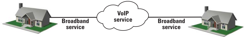
Figure 1: End-to-end VoIP