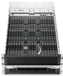
Figure 2: HP Moonshot System

The HP Moonshot platform, with up to 45 HP ProLiant m800 servers in a 4.2 Ru form factor