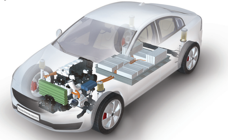
Figure 1. The powertrain system in an HEV.

Sensors and their feedback-control mechanisms promote the overall efficiency of engine and transmission systems by accurately monitoring stimuli to boost the efficiency of the combustion process.