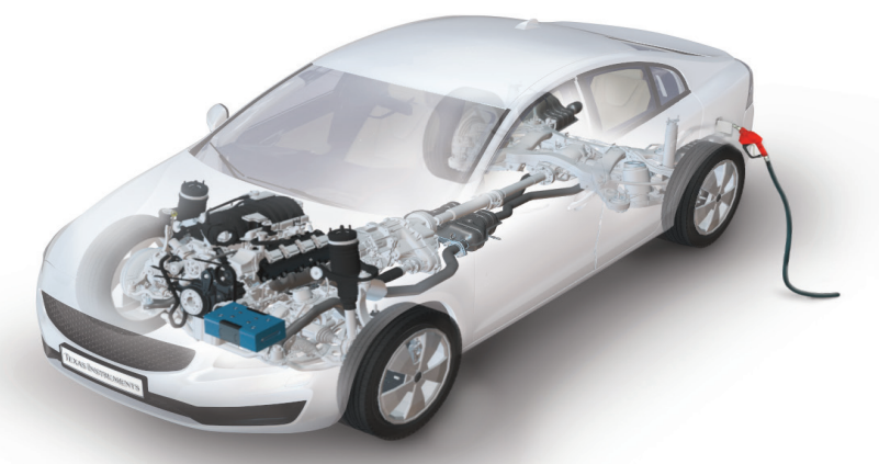
Figure 2. A traditional internal combustion engine.

Thermocouple. The demand for high-temperature sensors has been increasing with the advent of new diesel engines because the exhaust system is right below the engine. This configuration requires temperature detection with high accuracy, high resolution and high integration. Exhaust system temperature sensors capable of withstanding and detecting high temperatures mostly operate using thermocouple-based principles, with multiple thermocouple temperature sensors and one stand-alone module to control them.